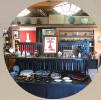
Tottori Folk Crafts Museum