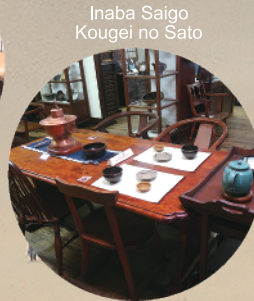
Inaba Saigo Kougei no Sato